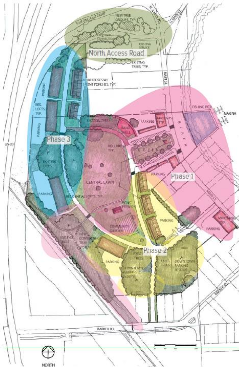
Figure 4: Phasing Plan: Park with Mixed Use – Moderate Development Intensity