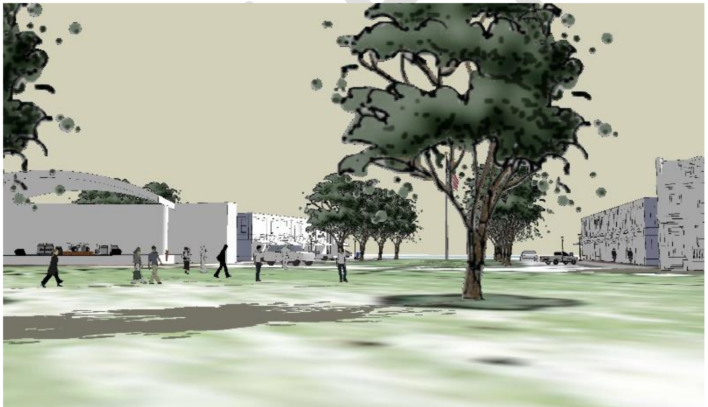
Figure 2: Town Green Rendering with Lake View